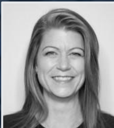
Member-at-Large Mayor Angela Birney City of Redmond