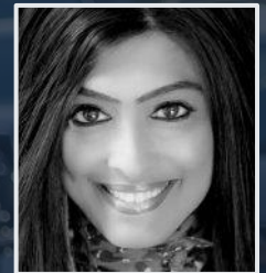
Latha Sambamurti Washington State Arts Commissioner