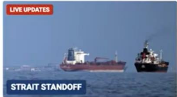
LIVE UPDATES STRAIT STANDOFF Iran takes 'control' of critical oil route, opens fire on vessel after Trump says US blockade will hold: official

So I took screenshot of both of the articles. I mean they are literally side by side. And so this is the first article I saw because the bear caught my eye. It says, "Bear attacked soldiers in Alaska after emerging from its den, officials say." Now, I'm not laughing because it attacked the soldiers, I'm just laughing because that was the most unexpected article, even though I should have expected it because we are talking about the Persian bear. I mean, for 14 lessons now, we've been talking about the bear. And then I see a big old bear on the headlines. And then I look across and right across from it, it says, "Iran takes control of critical oil route, opens fire on vessel after Trump says US blockade will hold: Official."