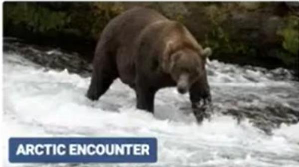
ARCTIC ENCOUNTER Bear attacks soldiers in Alaska after emerging from its den, officials say