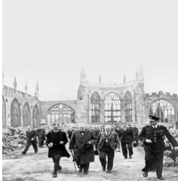
Winston Churchill touring the ruins of St. Michael's Cathedral 1941/1942

The idea originated at the Cathedral of St. Michael, in the Diocese of Coventry, England – born of the massive devastation inflicted at the height of the German Blitz on London and Coventry during World War II. During one of the many air raids conducted in 1940, the city's 14th century cathedral was completely destroyed as a result of the aerial bombardment.