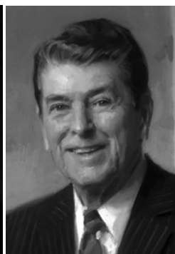
Ronald Reagan (1911-2004) Republican Term: 1981-1989 Birthplace: IL