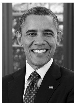
Barack Obama (1961- ) Democrat Term: 2009-2017 Birthplace: HI