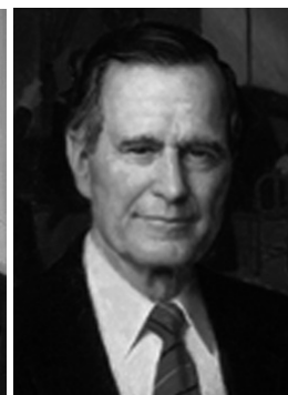
George H.W. Bush (1924-2018) Republican Term: 1989-1993 Birthplace: MA