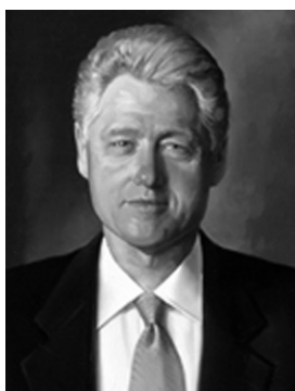
Bill Clinton (1946- ) Democrat Term: 1993-2001 Birthplace: AR