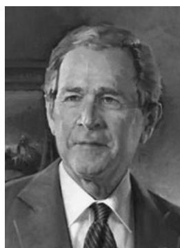
George W. Bush (1946- ) Republican Term: 2001-2009 Birthplace: CT