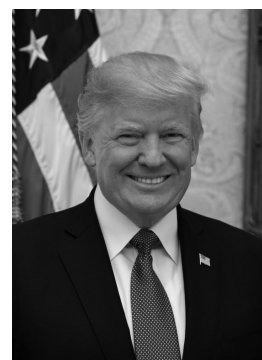
Donald Trump (1946- ) Republican Term: 2017- Birthplace: NY