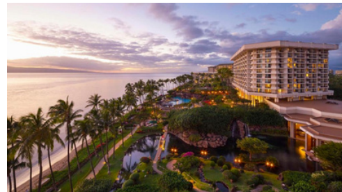
HYATT REGENCY MAUI RESORT AND SPA

The Waldorf Astoria Grand Wailea on Maui is looking for a Director of National Sales. The Director of National Sales at Waldorf Astoria Grand Wailea plays a key role in driving group business by serving as the primary liaison between the hotel and prospective clients. This individual is responsible for generating new sales opportunities, managing client relationships, and ensuring a seamless transition from sales to event execution. This role will be responsible for group sales within the Southeast, Southwest, and Canada markets. Hilton is the leading global hospitality company, spanning the lodging sector from luxurious full-service hotels and resorts to extended-stay suites and mid-priced hotels. For nearly a century, Hilton has offered business and leisure travelers the finest in accommodations, service, amenities and value. To apply, please CLICK HERE .