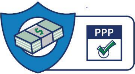
Paycheck Protection Program

This loan program provides loan forgiveness for retaining employees by temporarily expanding the traditional SBA 7(a) loan program.