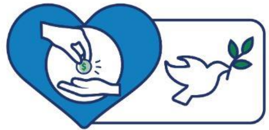
SBA Debt Relief

Enables small businesses who currently have a business relationship with an SBA Express Lender to access up to $25,000 quickly.