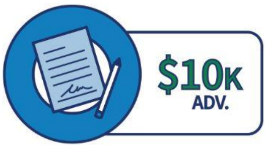
EIDL Loan Advance

This loan program provides loan forgiveness for retaining employees by temporarily expanding the traditional SBA 7(a) loan program.