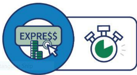
SBA Express Bridge Loans

This loan advance will provide up to $10,000 of economic relief to businesses that are currently experiencing temporary difficulties.