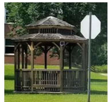
Wooden gazebo across from the entrance to Lot C

You will receive specific information about parking at all other venues from your Class Assistant unless, of course, it is obvious (e.g., library parking lot).