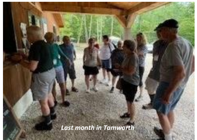
Last month in Tamworth