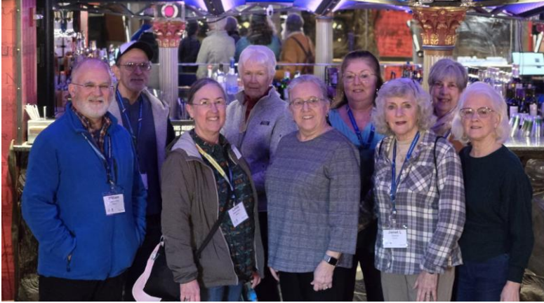
Members came from Derry, Kennebunkport, Bedford and, of course, the Seacoast region to attend one of the very first classes of the term – a tour of the historic Portsmouth Music Hall.