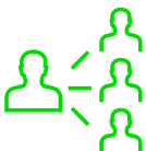
Payroll management and processing