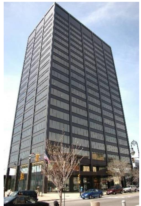
Below: The spectacular 24 Story Brady-Sullivan Tower in Manchester... the site of "LIVE UNITED Over the Edge 2018"