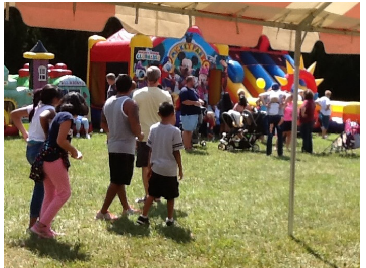
Fort Payne-DeKalb - Boom Days