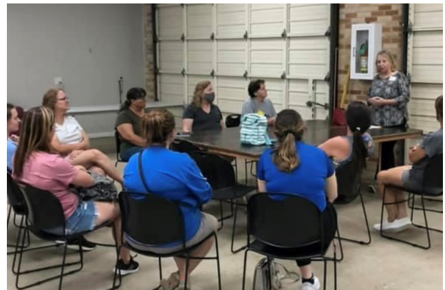
Thibodaux Planning Service Project for Bayou Boeuf School