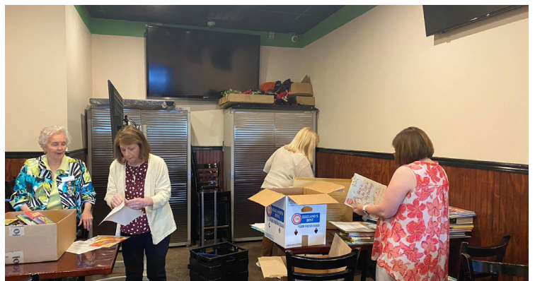
Kingsport - Sorting and Labeling Books