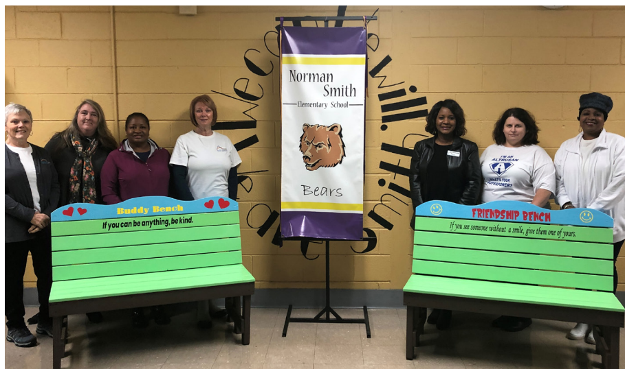
Clarksville - Buddy Bench