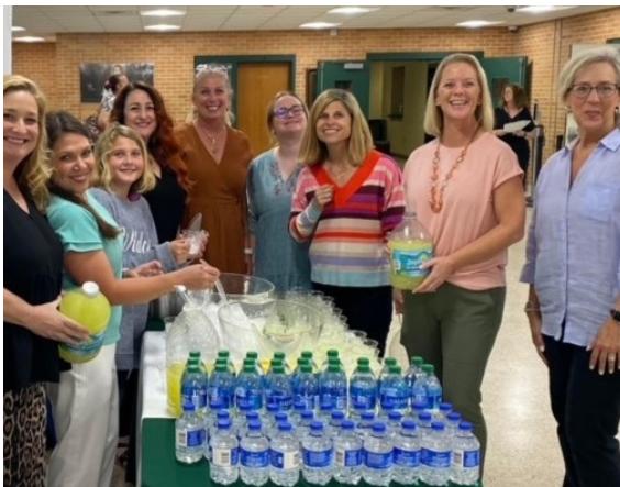
Enterprise Hosting Reception