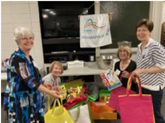
Recent Indianapolis, IN Service Project.