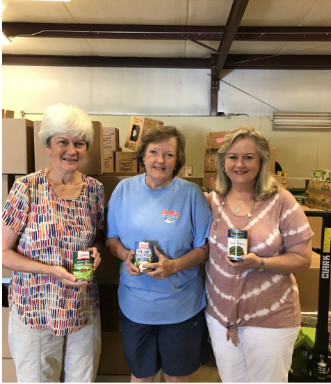
Greenwood - Community Food Pantry