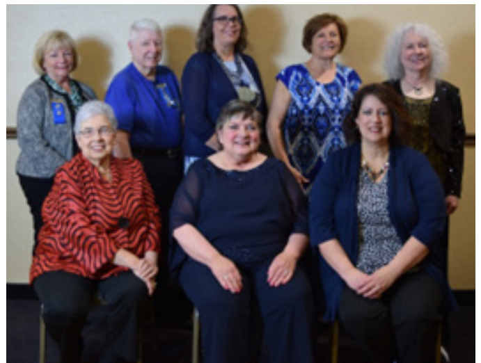
2021 - 2023 District Six Board