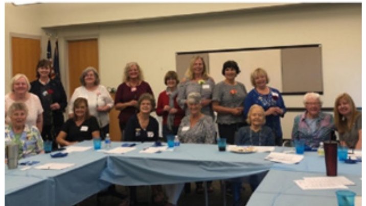
Evansville, IN Club Meeting