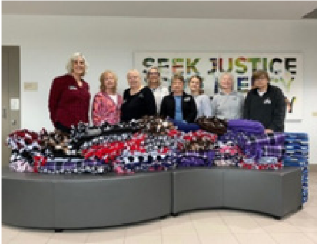
Altrusa Club of Fox Valley, IL. Knotting Blanket Project for Juvenile Justice Center