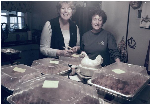
Baton Rouge - St. Vincent de Paul