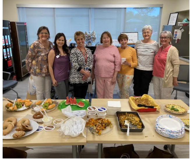
Oak Ridge Partners in Education Committee