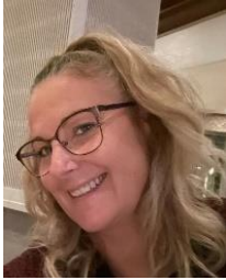
Hillary Sloan, Governor Elect