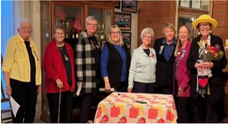
Altrusa of San Diego Installation of new officers.