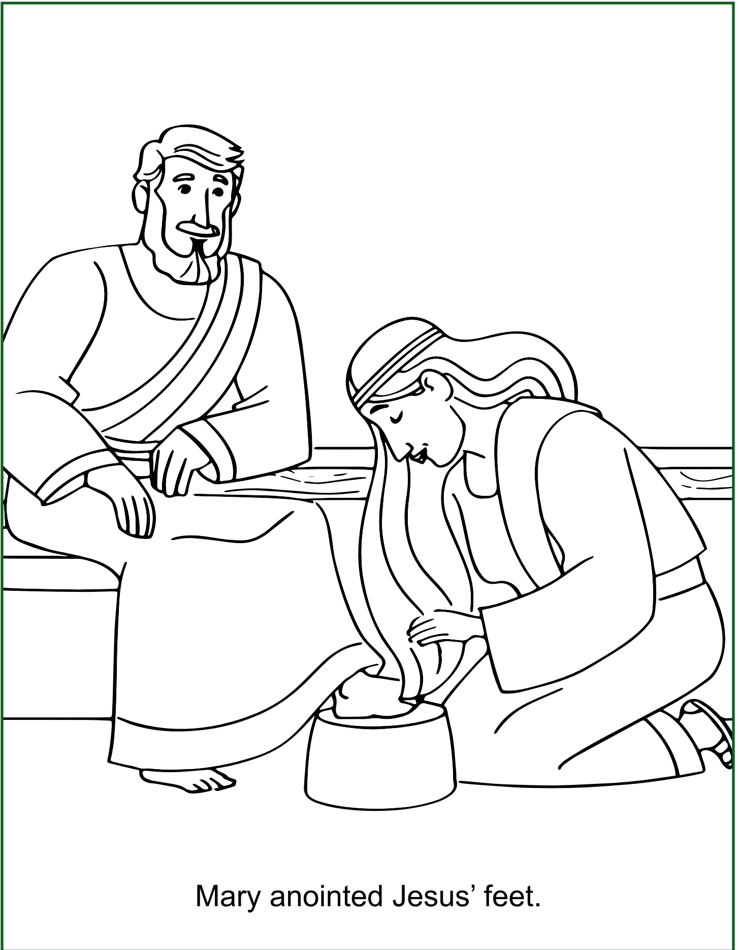
Mary anointed Jesus' feet.