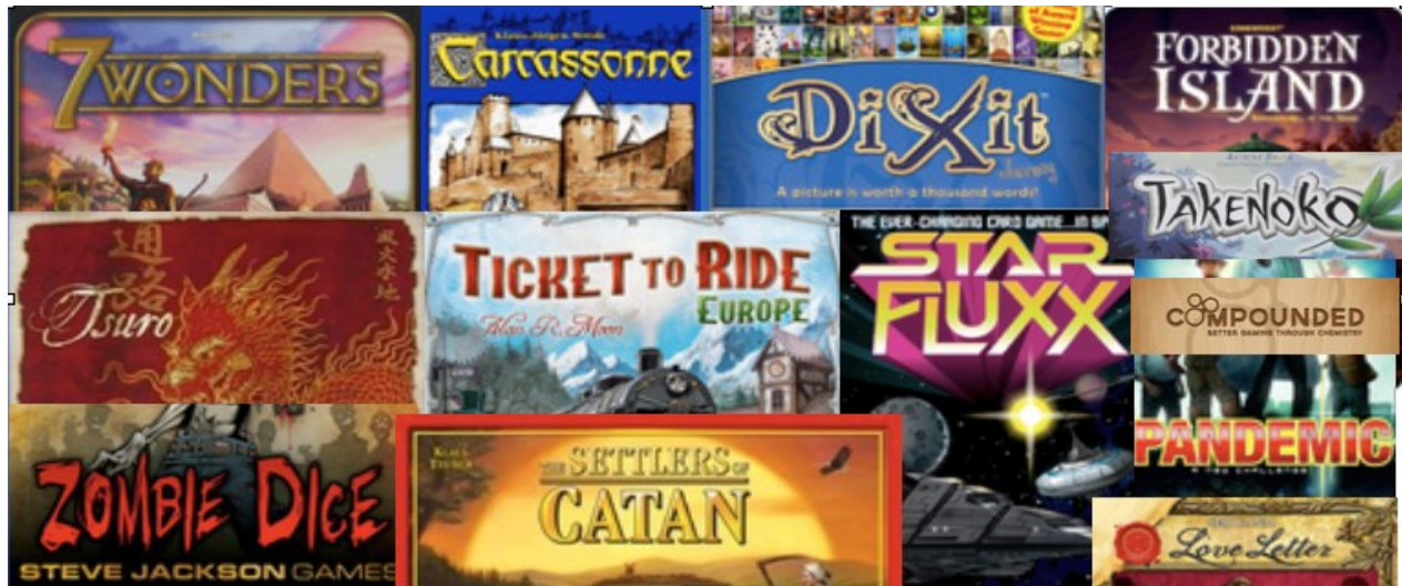
Table top games are a great way to get together and spend time with people. Middle schoolers should enjoy the opportunity to hang out, not do homework, and PLAY MORE GAMES!

Class Dates: Last Wednesday of every month (optional gaming on Fridays)