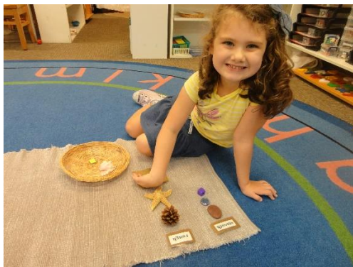
Rough & Smooth Basket