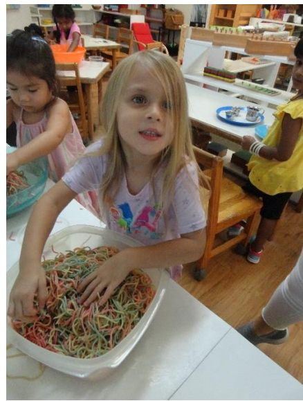
Feel and Find Sensory Tubs