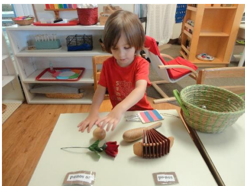
Sound & No Sound Basket