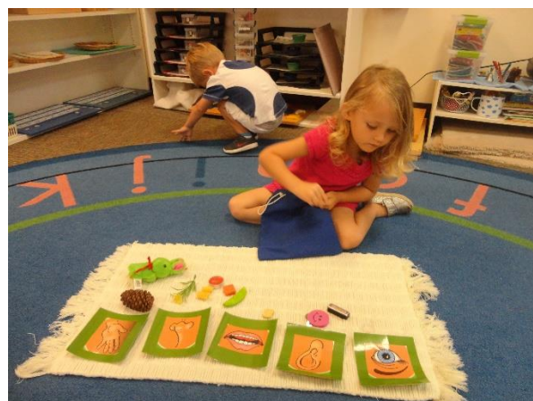
Five Senses Classification