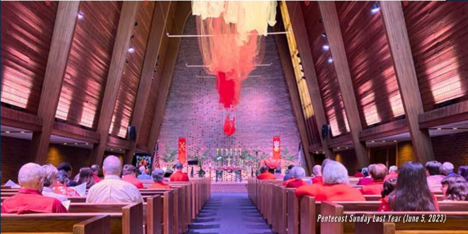
Pentecost Sunday Last Year (June 5, 2023)