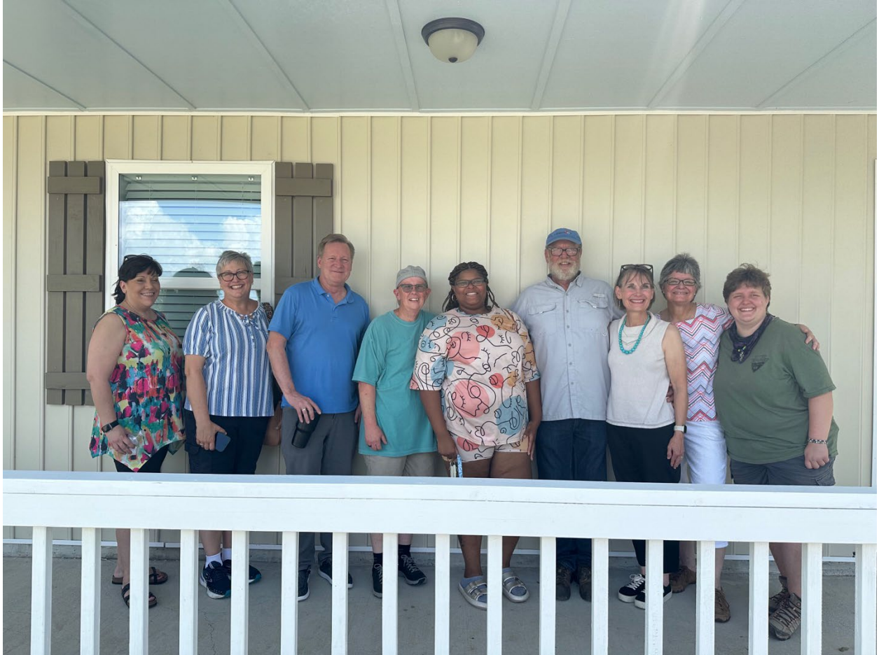
GRR Group at the Dedication with the Homeowner