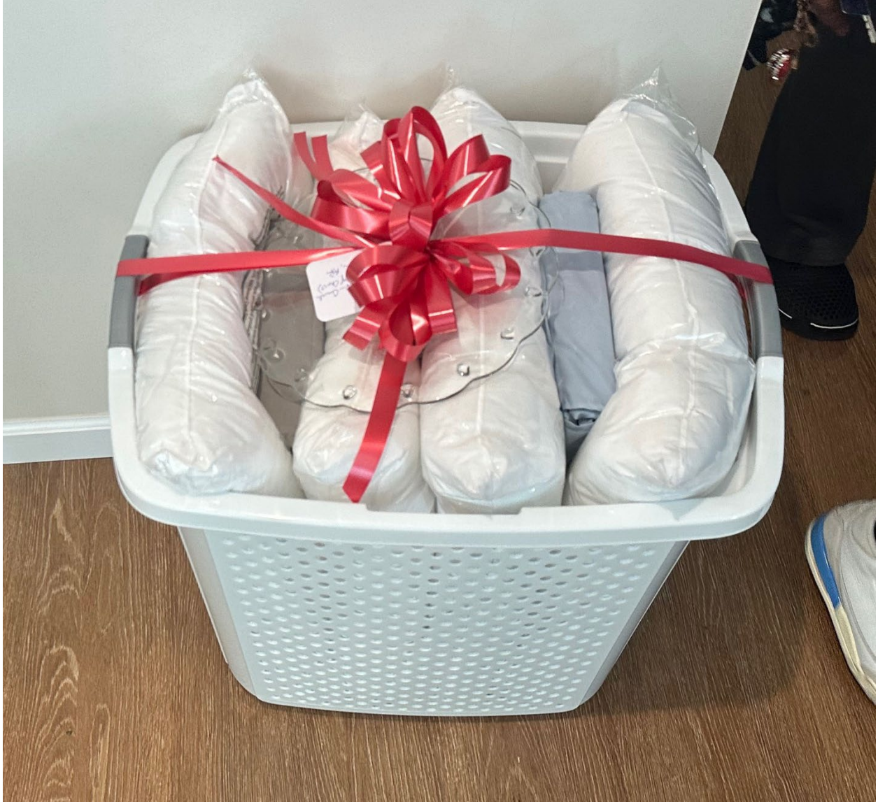
Gift basket from FCC Ft Smith, AR