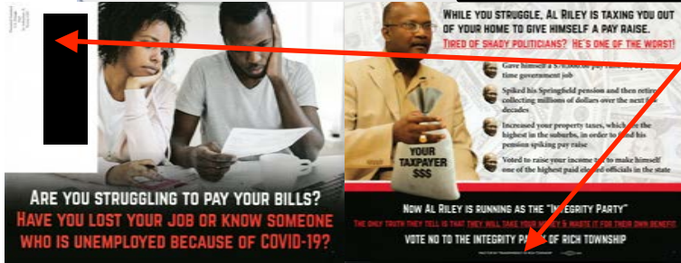
"Transparency Party of Rich Township" Permit #205