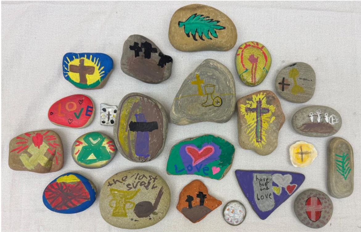
Easter rock art created by children in the Level II atrium (ages 6-9).