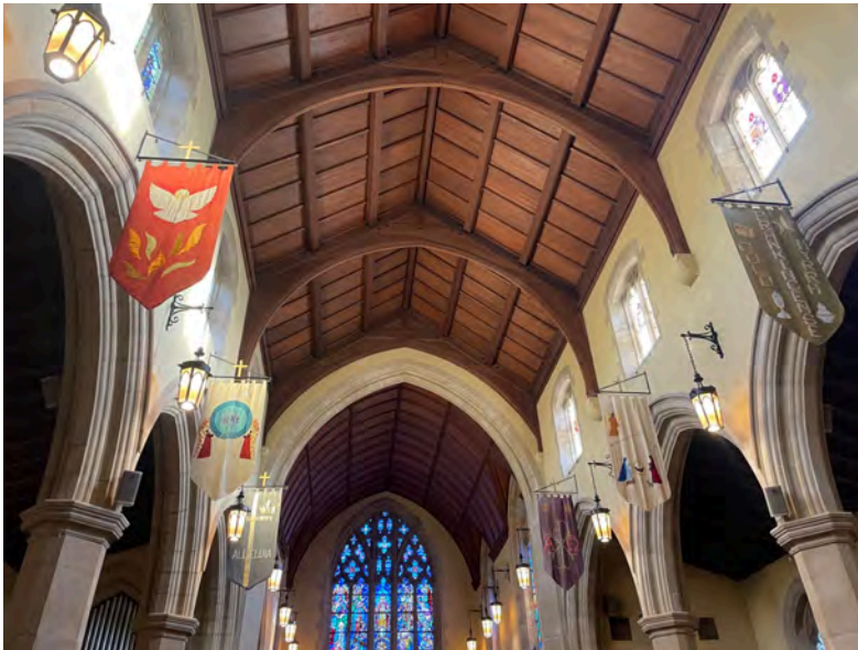
(fig 1.) Banners when facing the altar (taken from the font).