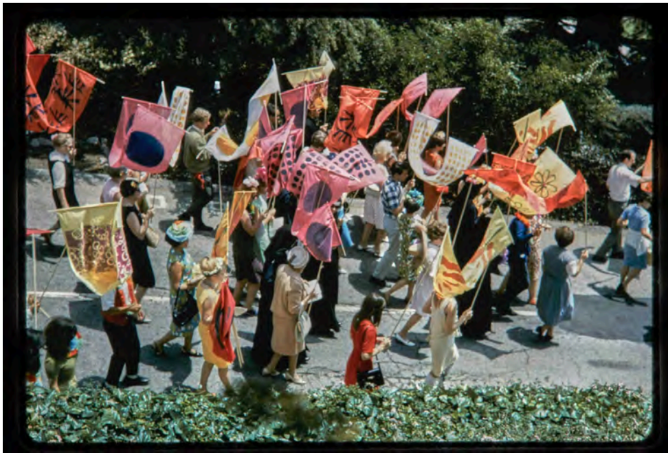
(fig. 5) Still from Alleluia film. Feast of Saint Mary at Immaculate Heart College, Los Angeles. 1964.