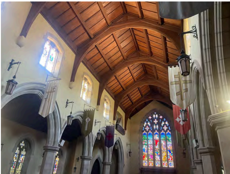
Banners when facing the font (taken from the altar).