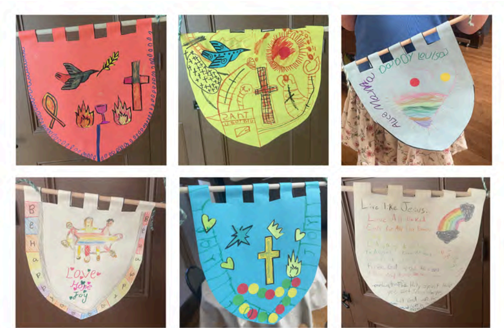
(fig 4.) 2025 Summer Sacred Arts Banner workshop. The kids made banners representing what church and faith means to them. They were asked: What banner would you add to the sanctuary? This is NOT what the banners will look like, but rather an example of how to roughly workshop ideas.