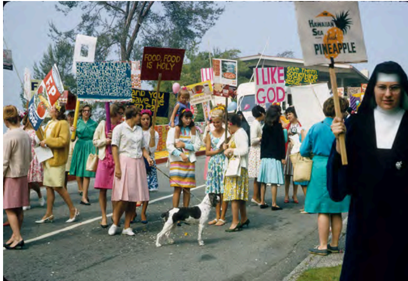
(Fig 7.) Feast of Saint Mary, Immaculate Heart College, Los Angeles. 1964.