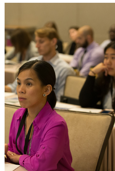
Members expand their knowledge of economic statistics and methods at the 2018 NABE Foundation Economic Measurement Seminar