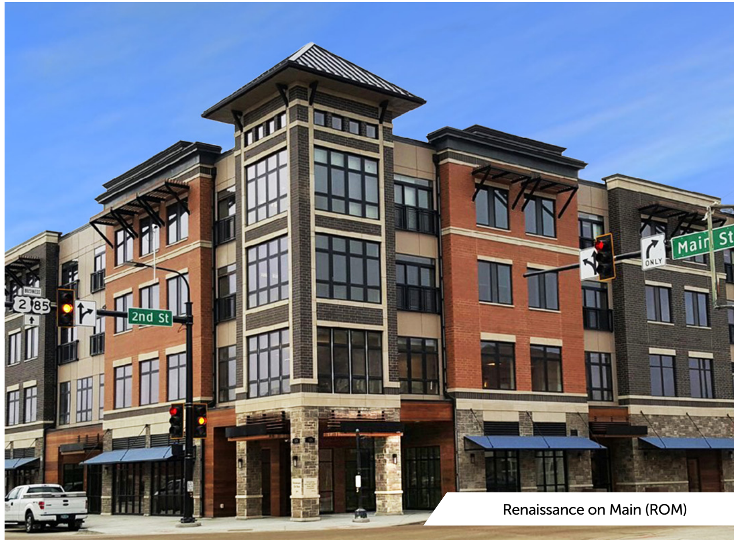
Renaissance on Main (ROM)