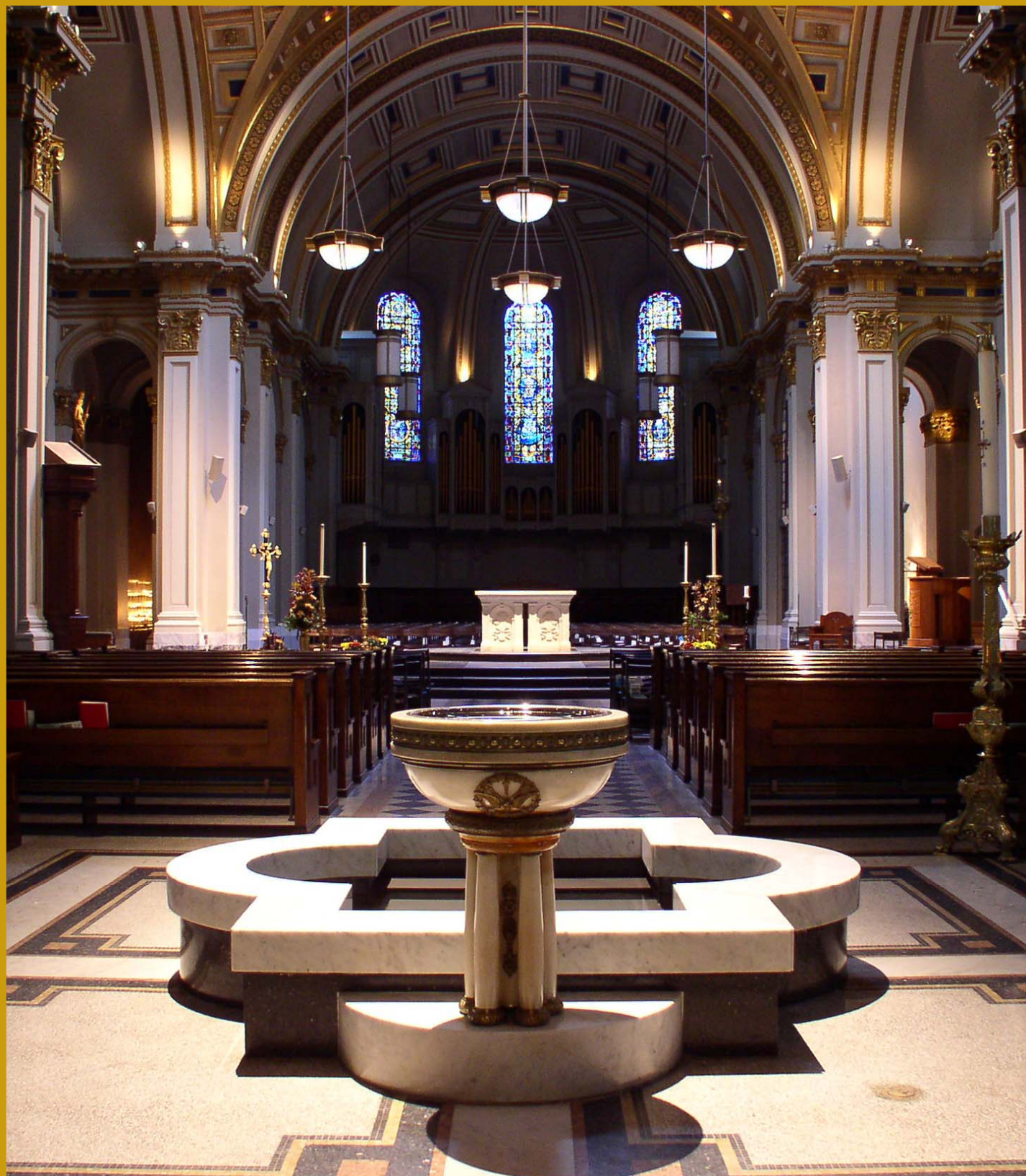
ST. JAMES CATHEDRAL The Fifth Sunday of Easter May 7, 2023