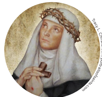
St. Catherine of Siena (1347-1380)

By this light I shall come to know that you, eternal Trinity, are table and food and waiter for us. You, eternal Father, are the table that offers us as food the Lamb, your only-begotten Son. He is the most exquisite of foods for us, both in his teaching, which nourishes us in your will, and in the sacrament that we receive in holy communion, which feeds and strengthens us while we are pilgrim travelers in this life. And the Holy Spirit is indeed a waiter for us, for the Spirit serves us this teaching by enlightening our mind’s eye with it and inspiring us to follow it. And the Spirit serves us charity for our neighbors and hunger to have as our food.