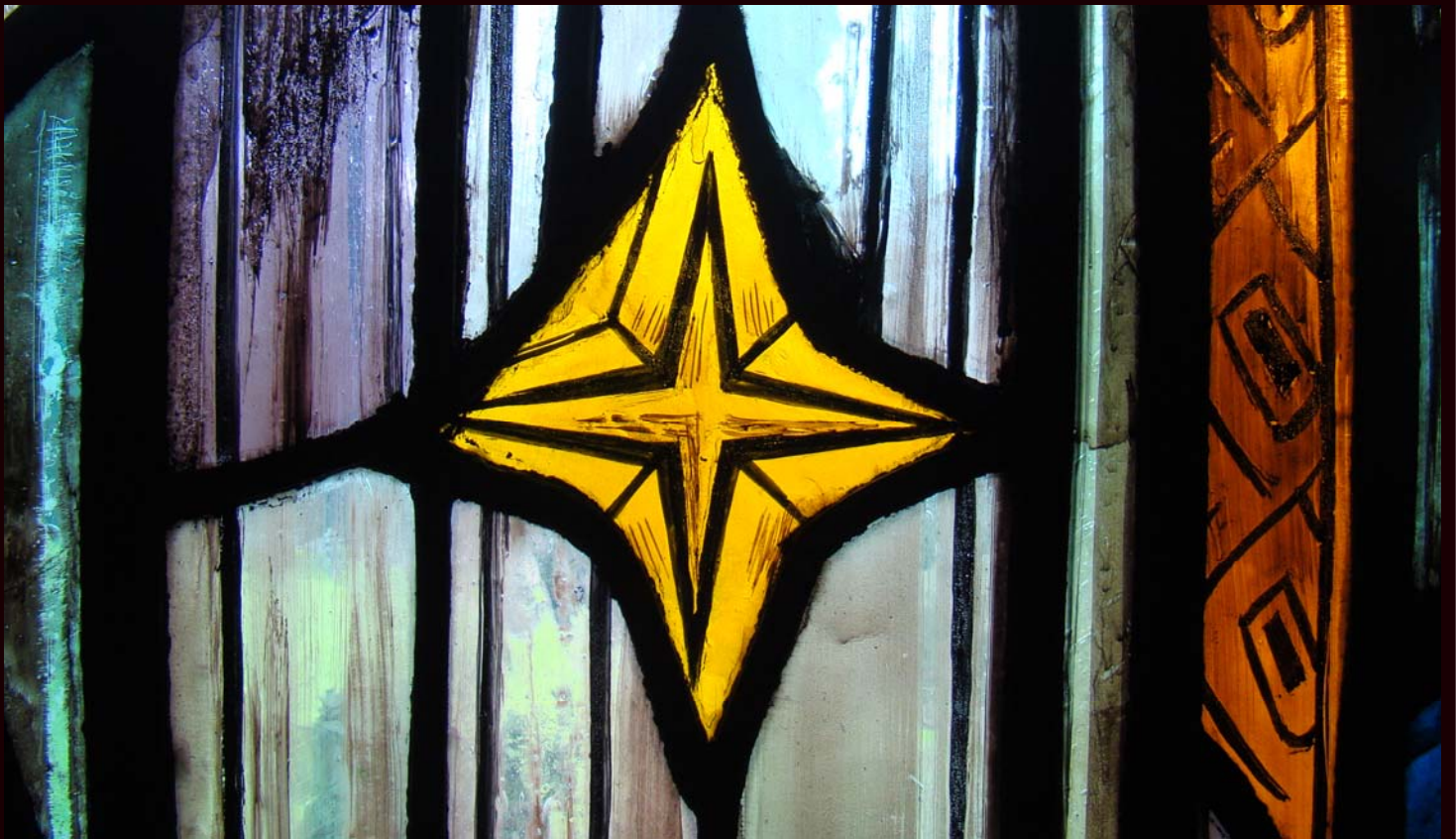
Stained glass window, Seattle University