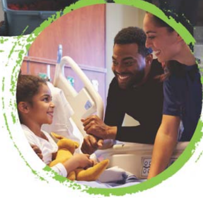
PICTURED FROM TOP LEFT: Youth Migrant Project, Seminarians, Hospital ministry