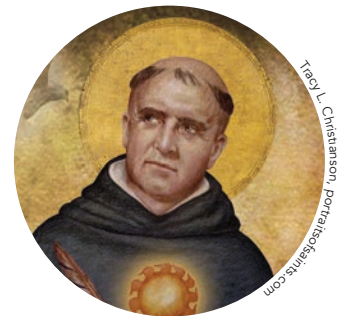
St. Thomas Aquinas (1225-1274)

O marvelous sacrament in which God is hidden, and our Jesus, like a new Moses, conceals his face under the creatures made by him! May every generation praise him! Wonderful is this sacrament in which, in virtue of the words of institution, the species signify and are changed into flesh and blood charged with the divine power; appearances remain in their proper substance; and, without violating the law of nature, the one and whole Christ himself is present in different places because of the consecration, as a voice is heard and exists in many places.... He is whole and entire and perfect in each and every fragment of the host, just as a hundred mirrors multiply the same visual appearance.