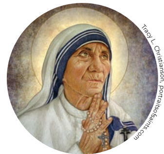
St. Teresa of Calcutta (1910-1997)

Jesus says time and again that we have to love one another. He had to come for that one purpose: to tell us that God loves us, that we are precious to him, that we have been created to love and to be loved, and that we must love one another as he loves us, as the Father has loved him.... When we look at the cross we know how he loved us. And when we look at the Tabernacle we know how he loves us still. That is why he made himself the Bread of Life... to satisfy our hunger for his love. And as if that were not enough for him, he made himself the hungry one, the naked one, the humblest one so that you and I can satisfy his hunger for our human love. This is something so wonderful—the sick, the poor, the unwanted, the unloved, the lepers, the drug addicts, the alcoholics, the prostitutes—Christ in the distressing disguises.