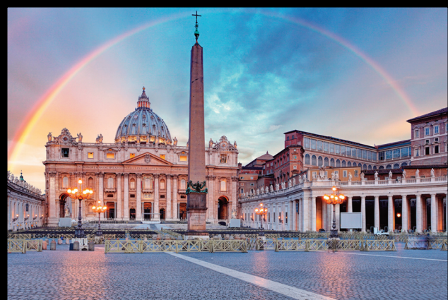
With Optional Three-Day Extension to Rome

Nazareth ✨ Cana ✨ Sea of Galilee ✨ Jerusalem ✨ Bethlehem ✨ Ein Karem ✨ Emmaus ✨ Rome