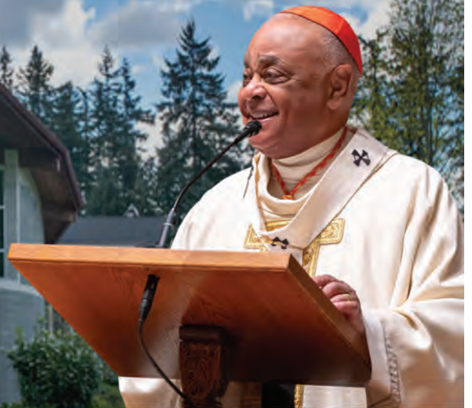
His Eminence Wilton Cardinal Gregory Keynote Speaker

St. Stephen the Martyr Church 10355 SE 192nd Street Renton, Washington 98058