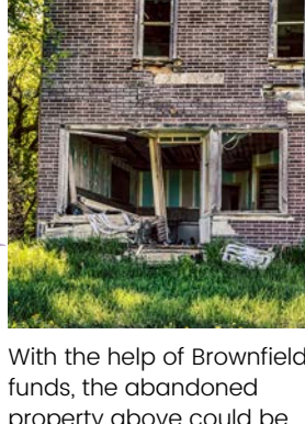
With the help of Brownfield funds, the abandoned property above could be transformed into a beautiful community park.

Visit: https://www.epa.gov/brownfields/brownfields-cleanup-grants