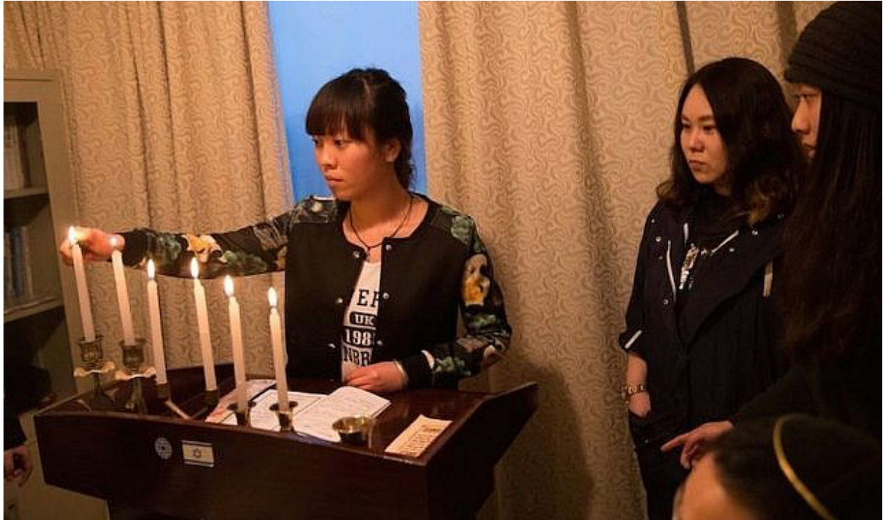
A few dozen of the 1,000 or so Jews in Kaifeng, in eastern China, gather to celebrate Hanukkah, December 6, 2015.