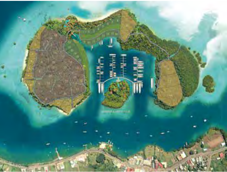
View of central Korovesa, Nawai Lailai and the foreshores of Nawai Island itself, seen from Savusavu, where the Nawai Island project is taking place. The graphic shows how planned superyacht berths are located, with both 35-55m superyachts and larger ones vying for facilities