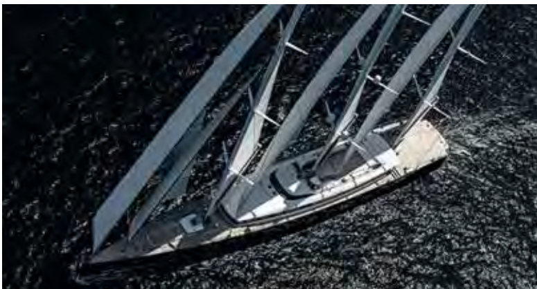
This magnificent aluminium schooner, the 81m Sea Eagle 11 , was recently launched by Royal Huisman for a Taiwan businessman and philanthropist who is a repeat client. The delivery emphasises a strong interest in super sailboats in Asia-Pacific waters, where passage-making can be considerably extended by wind power and solar energy to run electrical systems aboard. Bart Kimman of Camper & Nicholsons reports strong interest in pre-owned super sailboats, some built by now-closed Alloy Yachts, and others by Perini Navi in Italy

The annual Top 100 Superyachts of Asia-Pacific 2021 reflects somewhat reduced passages in the region, although places like the Maldives and the Seychelles in the Indian Ocean, and Fiji and Tahiti in the South Seas, are providing welcome and relatively covid-free options in late 2020. Cruising and chartering in these waters is building momentum again.