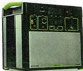
Portable Backup Battery

Get a free , clean-energy backup battery to operate your medical device during an outage.