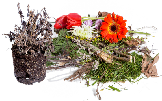
Grass, Branches, Leaves, Plants and Flowers