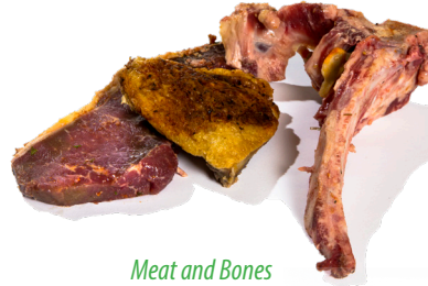
Meat and Bones