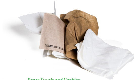
Paper Towels and Napkins