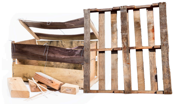
Wooden Pallets, Wood Boxes, Chopsticks and Lumber Scraps (untreated, unpainted, unstained - Nails Okay)