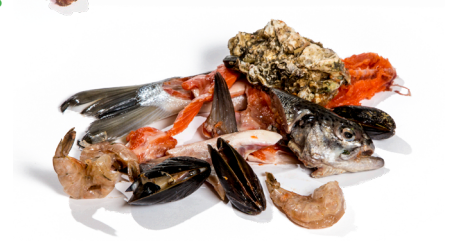
Seafood and Shells