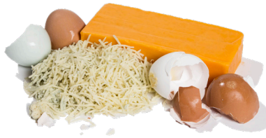
Dairy and Eggs