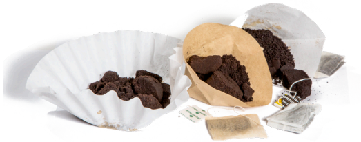
Coffee Grounds, Filters and Tea Bags