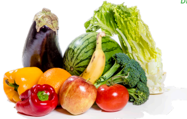
Fruits and Vegetables