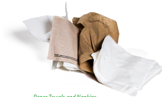
Paper Towels and Napkins