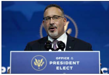
Miguel Cardona, Biden's Pick for Education Secretary

President-elect Biden's appointee will transform the DOE. His leading contenders, Lily Eskelsen Garcia and Randi Weingarten, are former teachers and union presidents who, unlike DeVos, have