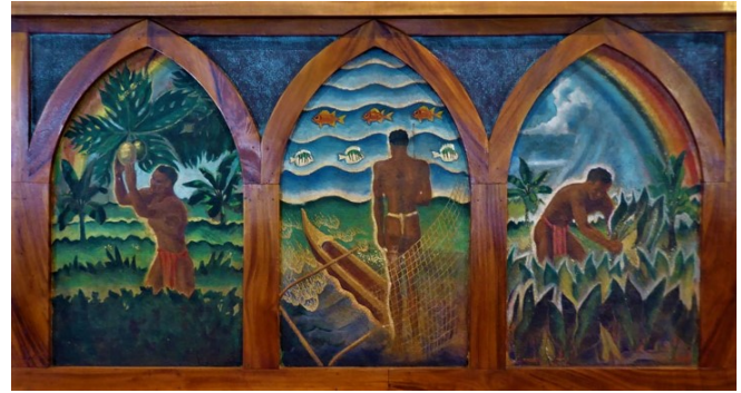
Harvesting breadfruit, fish and taro symbolize the bread of life of communion.

The painting framing the Church entrance features a hala tree and ti plants, both useful and sacred to Hawaiians. Arching over them is a Hawaiian Rainbow symbolizing God's blessings.