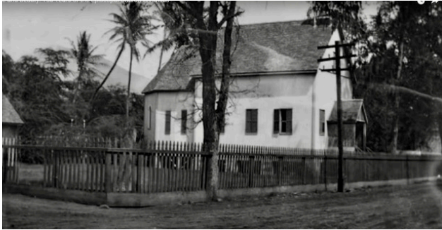
Holy Innocents' first Church building constructed in 1872 across from today's Church.