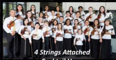
4 Strings Attached Cocktail Hour

Open Premium Bar – Wine on the Table - Appetizer Buffet - Dinner