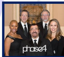
After Dinner Entertainment Phase4