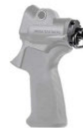
BREACHING SHOTGUN STOCK REPLACEMENT PLUG