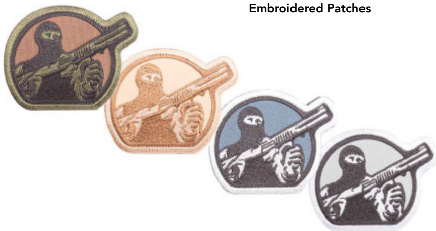
Mesa Tactical Embroidered Patches