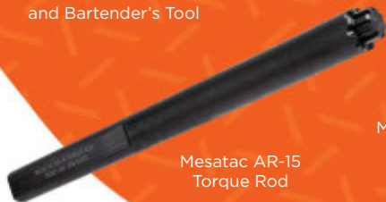
Mesatac AR-15 Torque Rod