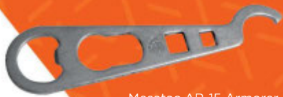
Mesatac AR-15 Armorer and Bartender's Tool