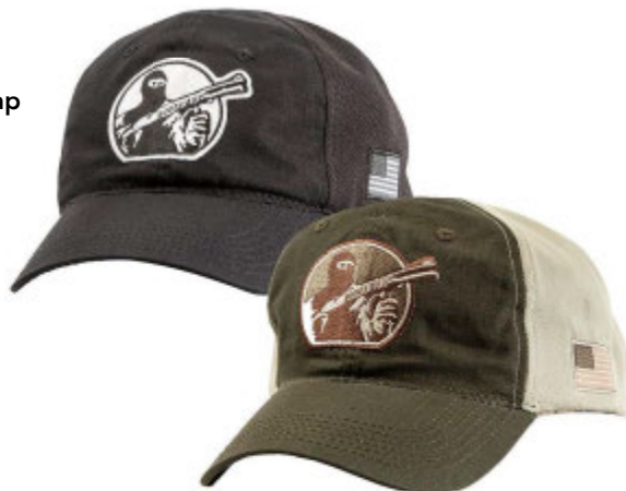
Mesa Tactical Operator's Cap Black or Khaki