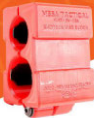
Mesatac Shotgun Vise Blocks