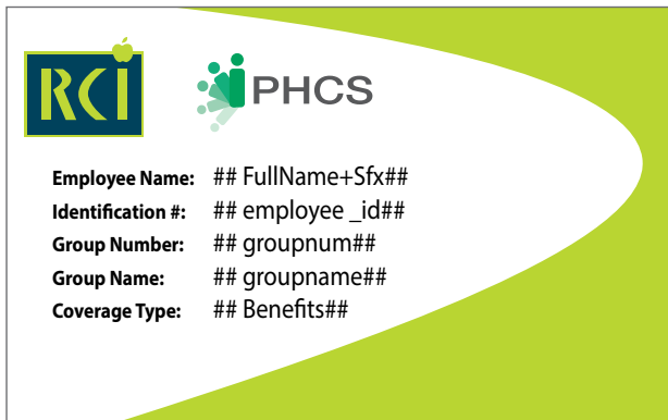
Front of card