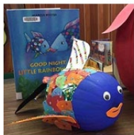
Book Character Pumpkin Decorating Contest at Melfort Public Library.