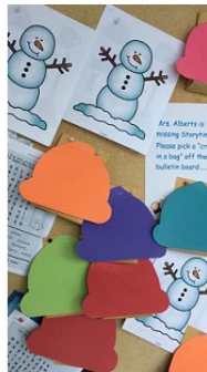
Craft in a bag at Leoville Public Library.

Unable to conduct in-house programming due to COVID-related restrictions, Wapiti's branch libraries quickly adapted by offering a variety of activities designed to take place outside the library.