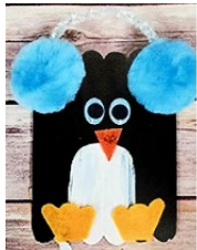
Winter Penguin Take and Make Craft kit at Nipawin Public Library.