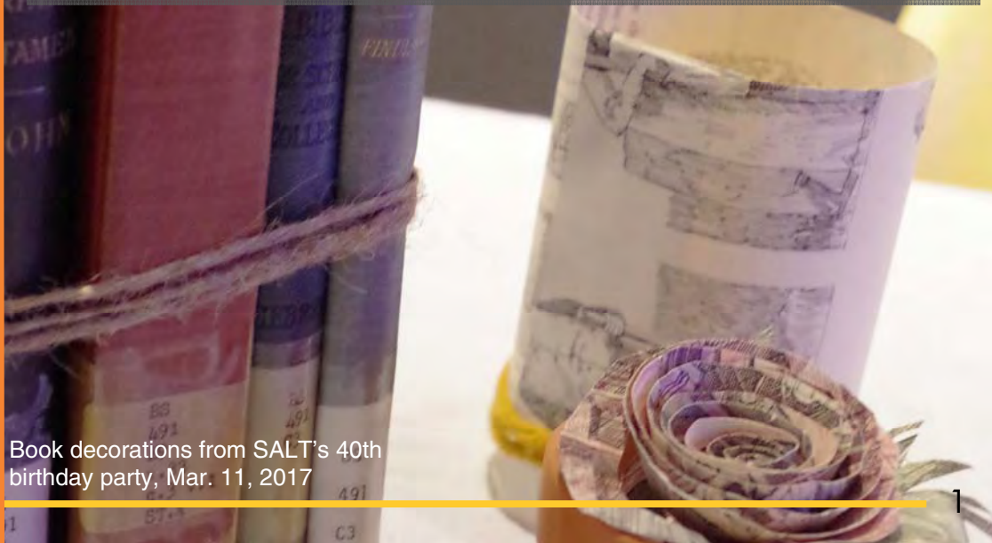
Book decorations from SALT's 40th birthday party, Mar. 11, 2017

A Facebook and Twitter group has also been created called "Save Saskatchewan's Libraries". I encourage you to join. There are also a number of rallies and sit-in's planned throughout our province, with information being shared on the Save Saskatchewan Libraries Facebook page. SALT encourages you to continue contacting us through our Facebook page, as well as through our website. Have information about an event being organizing in your community or library? Please feel free to send information to our FB page https://www.facebook.com/sasksalt/ and we would be happy to help spread the word!