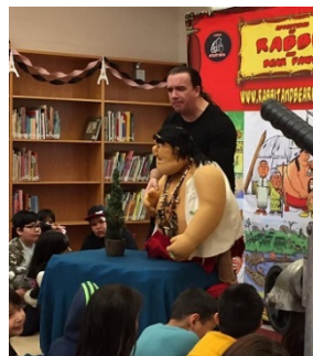
Rabbit and Bear Paws at Bernard Constant Community School. Hosted by James Smith Public Library.