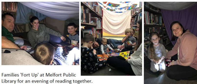
Families 'Fort Up' at Melfort Public Library for an evening of reading together.