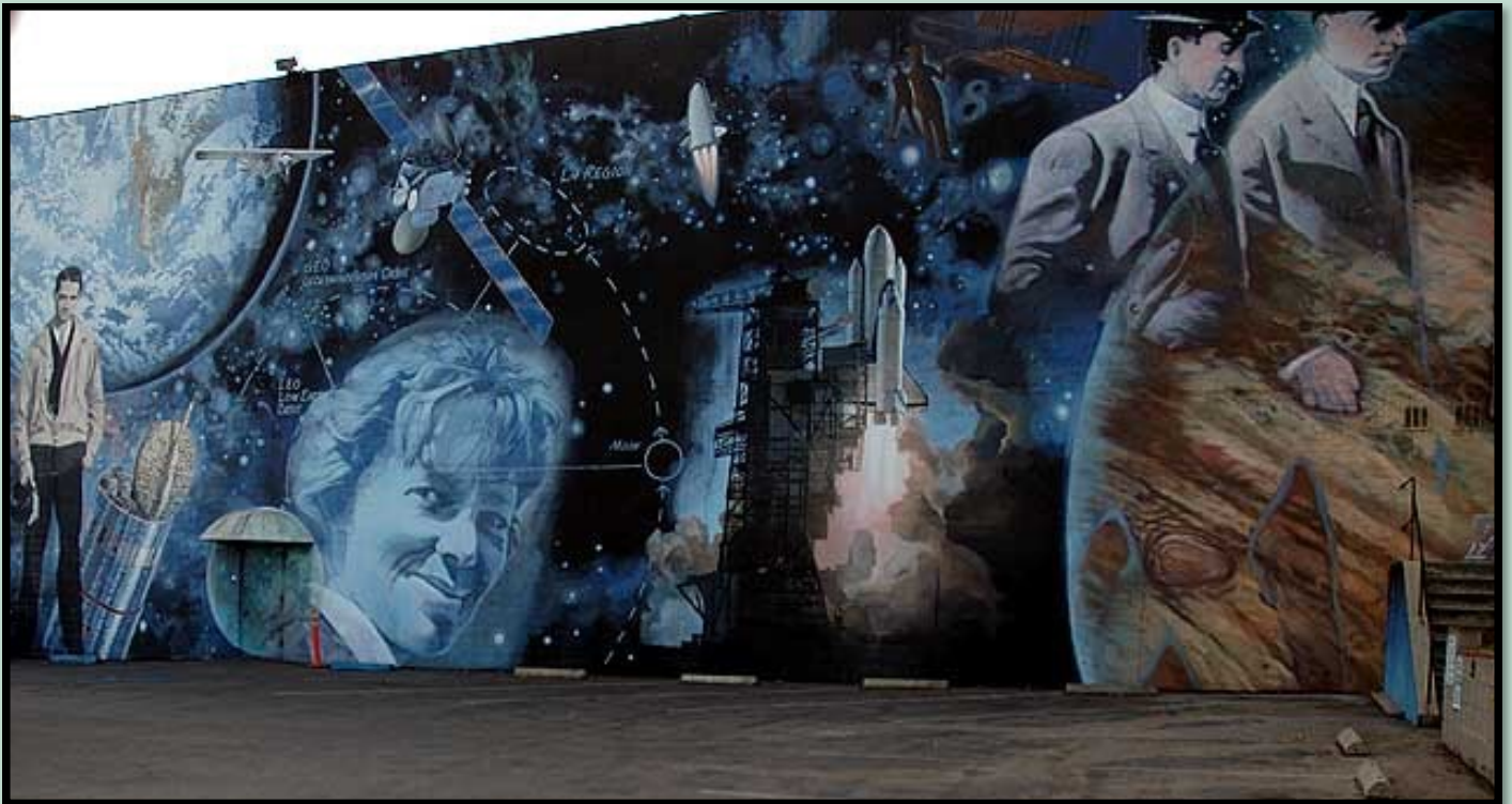
The Spirit of Aerospace mural by artist Scott Bloomfield El Segundo