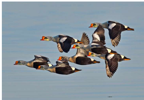
King Eiders