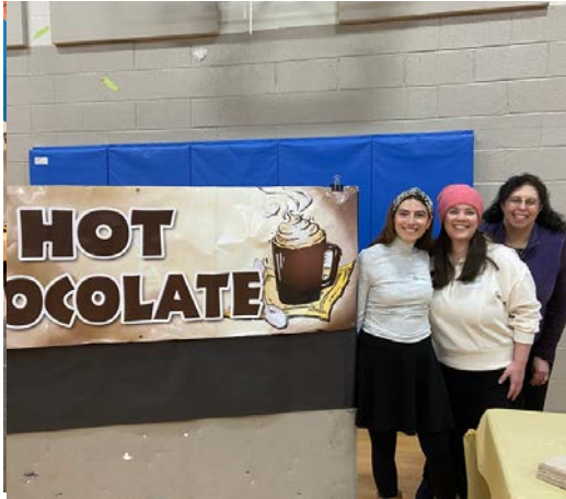
Return from Winter Break Hot Chocolate Celebration