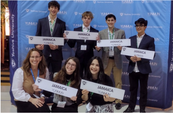
Yeshiva University Model United Nations