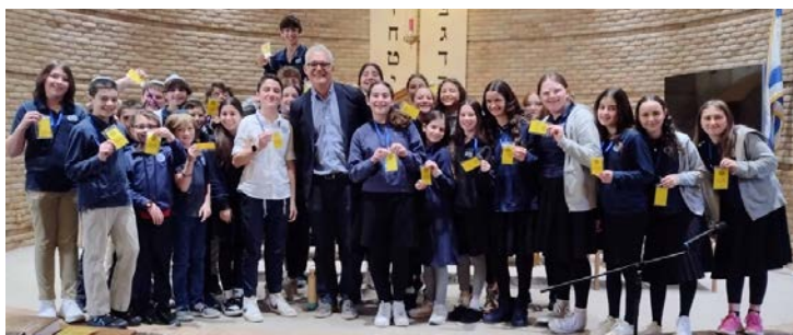
Junior High Spelling Bee

Just a few pictures. So much learning and many experiences!