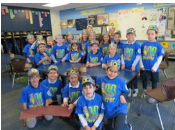
100 Days of School