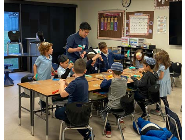
After School Activities