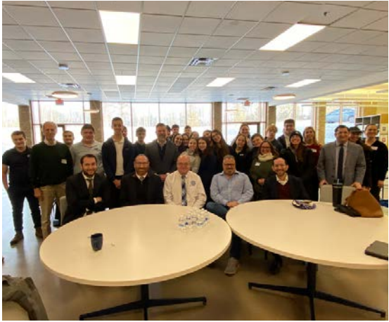
Congressman Mike Carey