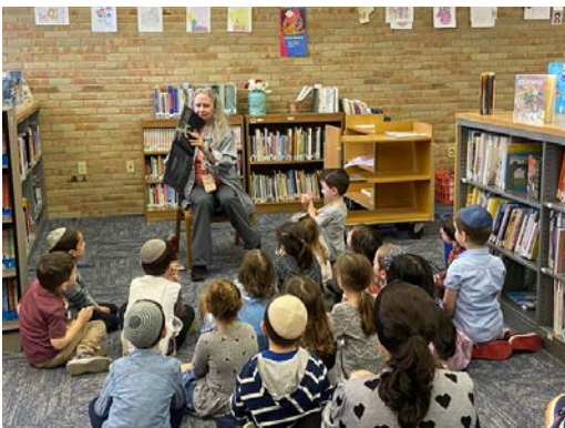
Kindergarten Preview Day