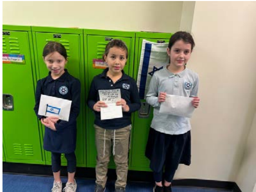
Notes for Israeli Families