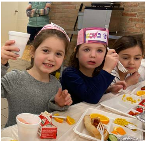
Tu B'Shevat Smoothies