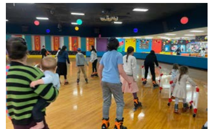
PTO Roller Skating