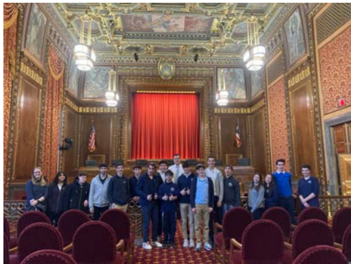
10th and 11th Grade to Ohio Supreme Court