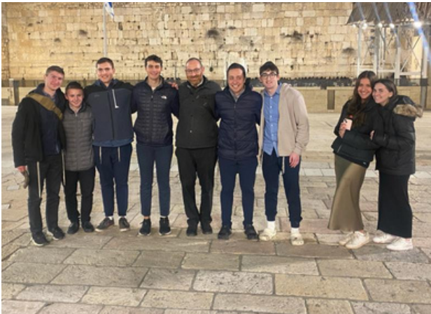
Alumni in Israel