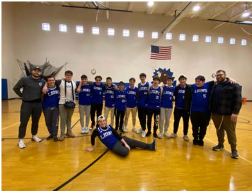
Tanzman Basketball Tournament