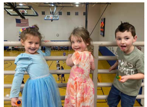
Basketball & Grade Level Nights