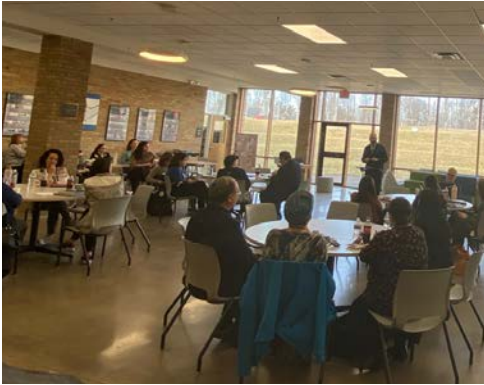
Teacher Professional Development