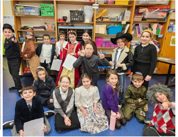
3rd Grade Biography Reports