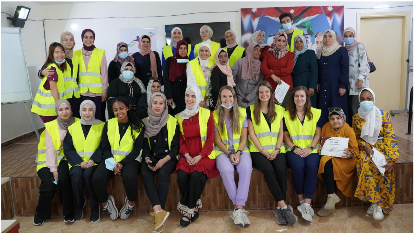
By the end of our work this summer, we had trained 5 MGH Institute students from the US, 7 Masters of Rehabilitation students from Jordan, 23 community-based rehabilitation workers from 3 different refugee camps, and created home programs for mothers of 20 kids with disability.