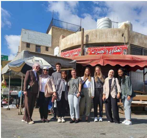
MGH Institute team, Day 1 in camp