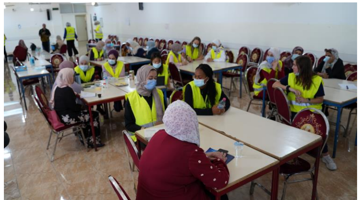
Day 1, orientation- we had five groups (1 MGH Institute student, 1-2 Jordanian students, 2-3 CHWs per group. We had 3 days of lectures and workshops and 4 days of application with families with children with disability.