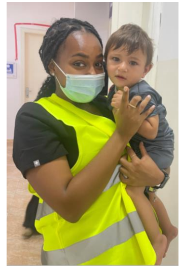
Some pictures of the kiddos we got a chance to work with. Their mothers were trained in-home programs tailored for their child's rehabilitation needs.