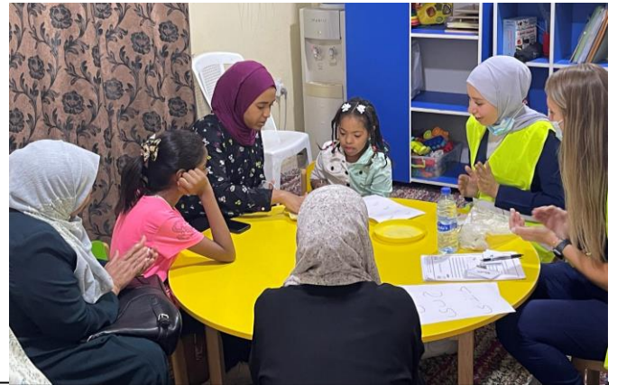
Practical training sessions comprised of MGH Institute OTD students, Masters students in Clinical Rehabilitation from Jordan, CHWs, and the mother/family of child with disability