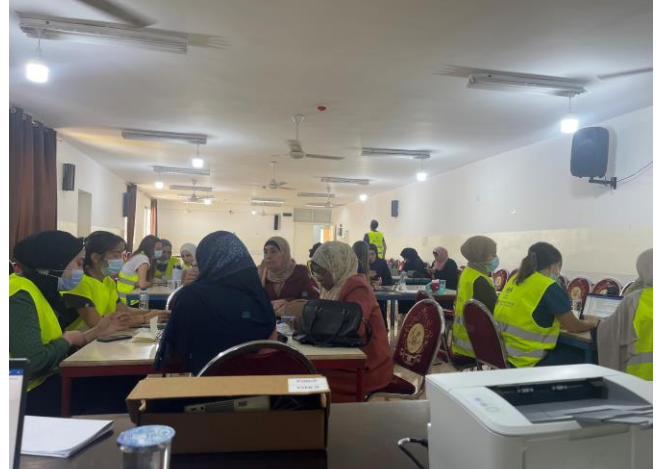
Day 3, students took over training the CHWs on treatment planning and implementing intervention, focusing on developing home programs for mothers of children with disability