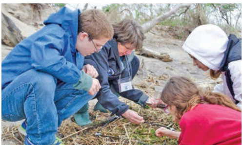
The 31st Annual Spring Student Summit will be held May 15th and 16th on Sandy Hook.