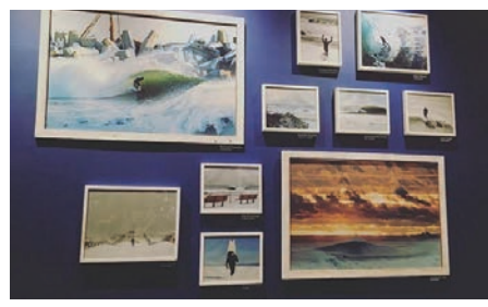
The Frozen Slides community gallery opening at Patagonia Bowery raised over $1,000 for COA.

It was an unusually warm winter day but that didn't stop the team at the Patagonia Bowery store from radiating some truly wintery vibes with the release of their Frozen Slides Winter Surf Gallery. All winter, the Bowery-based store asked folks to submit their favorite photos celebrating snowy, wintery days of surf.