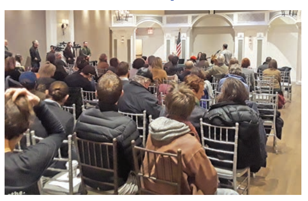
The NYDEC hosted a public hearing on NESE on February 26. An additional public hearing will be held on Wednesday, March 6, at 5pm at the Rockaway Park High School for Environmental Stainability, Rockaway, NY