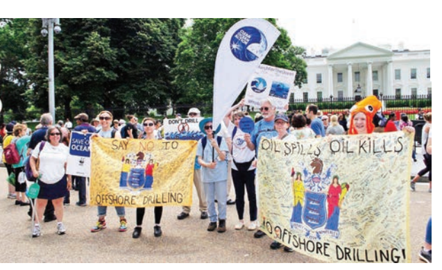
Oppose seismic blasting and other offshore oil and gas developments in the Atlantic at the March 18 Rally at the Cape May Convention Hall, 12 noon