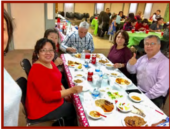
ICR celebrates the birthdays of all members on the last Sunday of each month with a meal after the service.