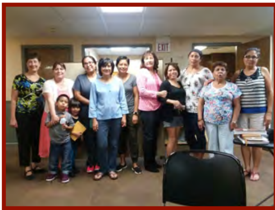
The women's ministry meets every other week. Their objective is to assume a leading role in serving God and helping others within their family, their church and the community.