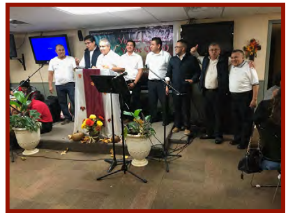
The men's ministry provides the men of ICR a great experience to grow spiritually as well as to grow in our relationship with each other. Touching on various topics in the Bible, the men are encouraged to grow in their personal relationship with Jesus Christ.