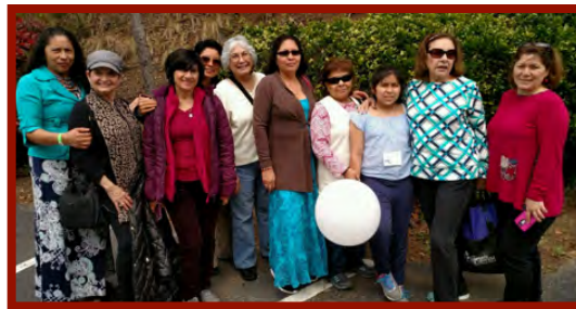
Many of the ladies of Iglesia Cristo Reina attended the Spring WMU Hispanic Retreat on the grounds of the GA Baptist Convention Center in Toccoa, GA.